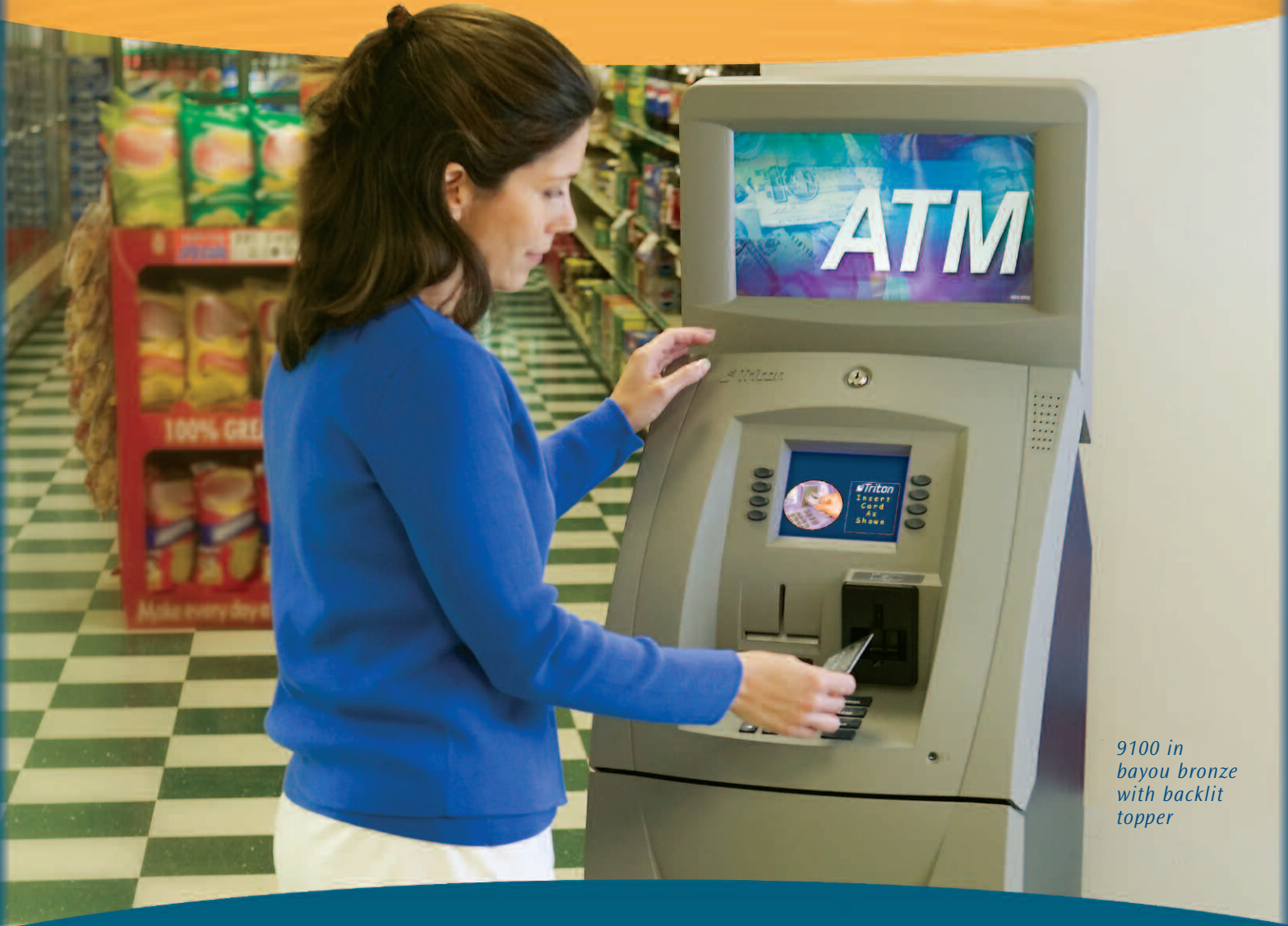
9100 in bayou bronze with backlit topper