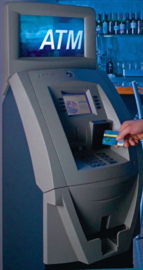
8100 with backlit topper